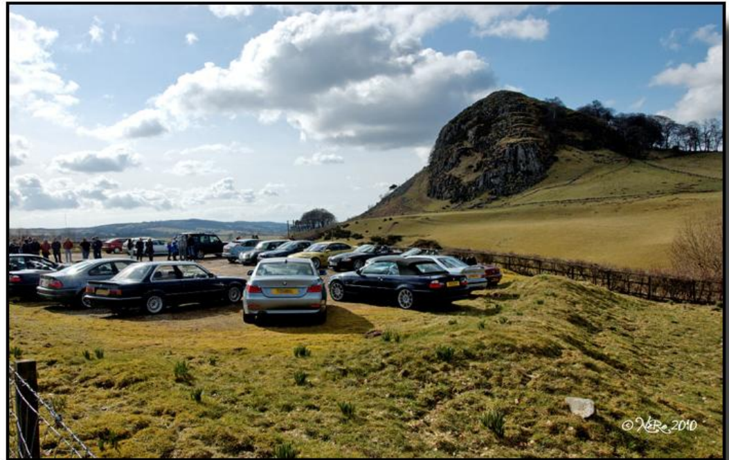
BMWCC Scottish Region Meet - 4th April 2010