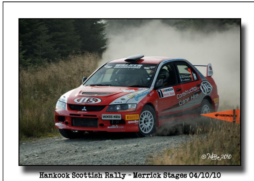
Hankook Scottish Rally - Merrick Stages 04/10/10