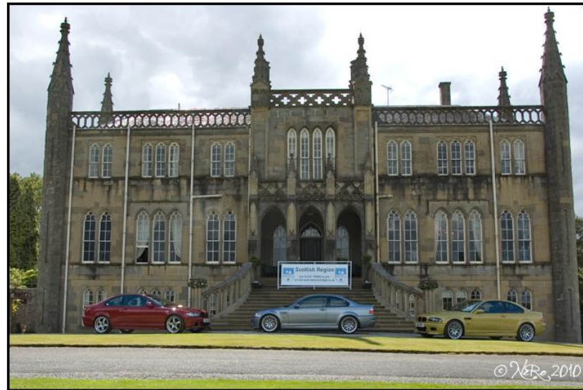
Show & Shine winners @ Ross Priory