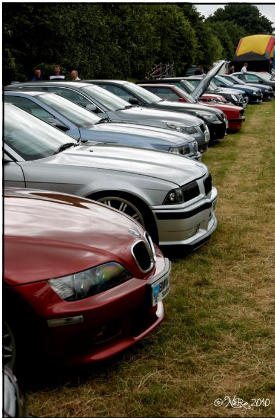
Moffat Classic Car Rally 2010

We headed down to Moffat for the Scottish Rootes Enthusiasts Show which has become one of our annual favourites.