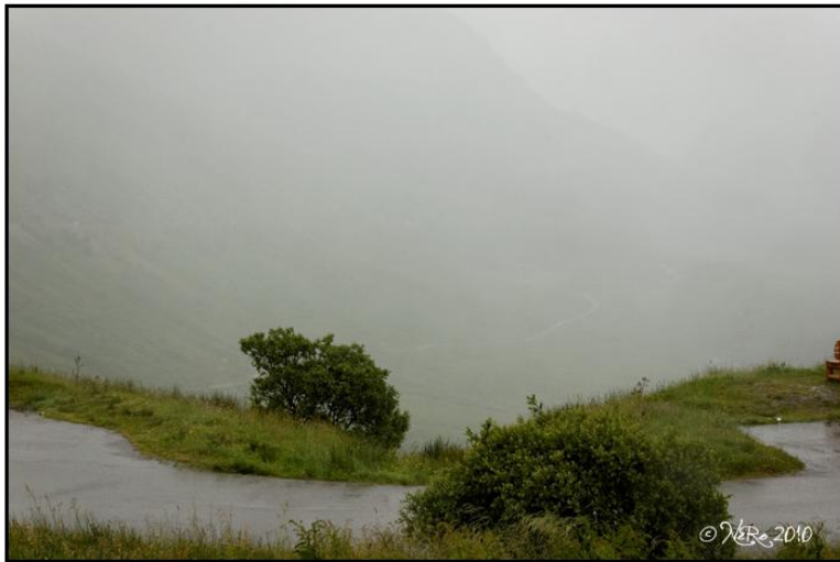
The Rest and Be Thankful

We headed off to Inveraray stopping of for photos at 'the Rest & be Thankful' but the torrential rain spoiled that plan!